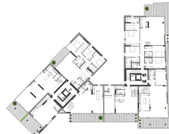
FIFTH FLOOR - DUPLEX