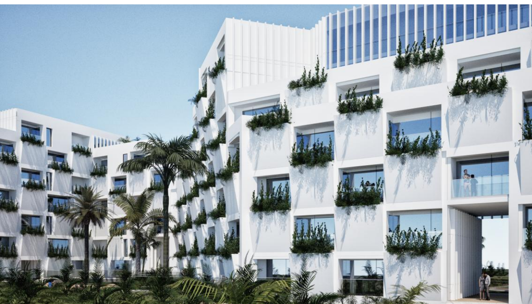
View from the Courtyard of the Apartment Building