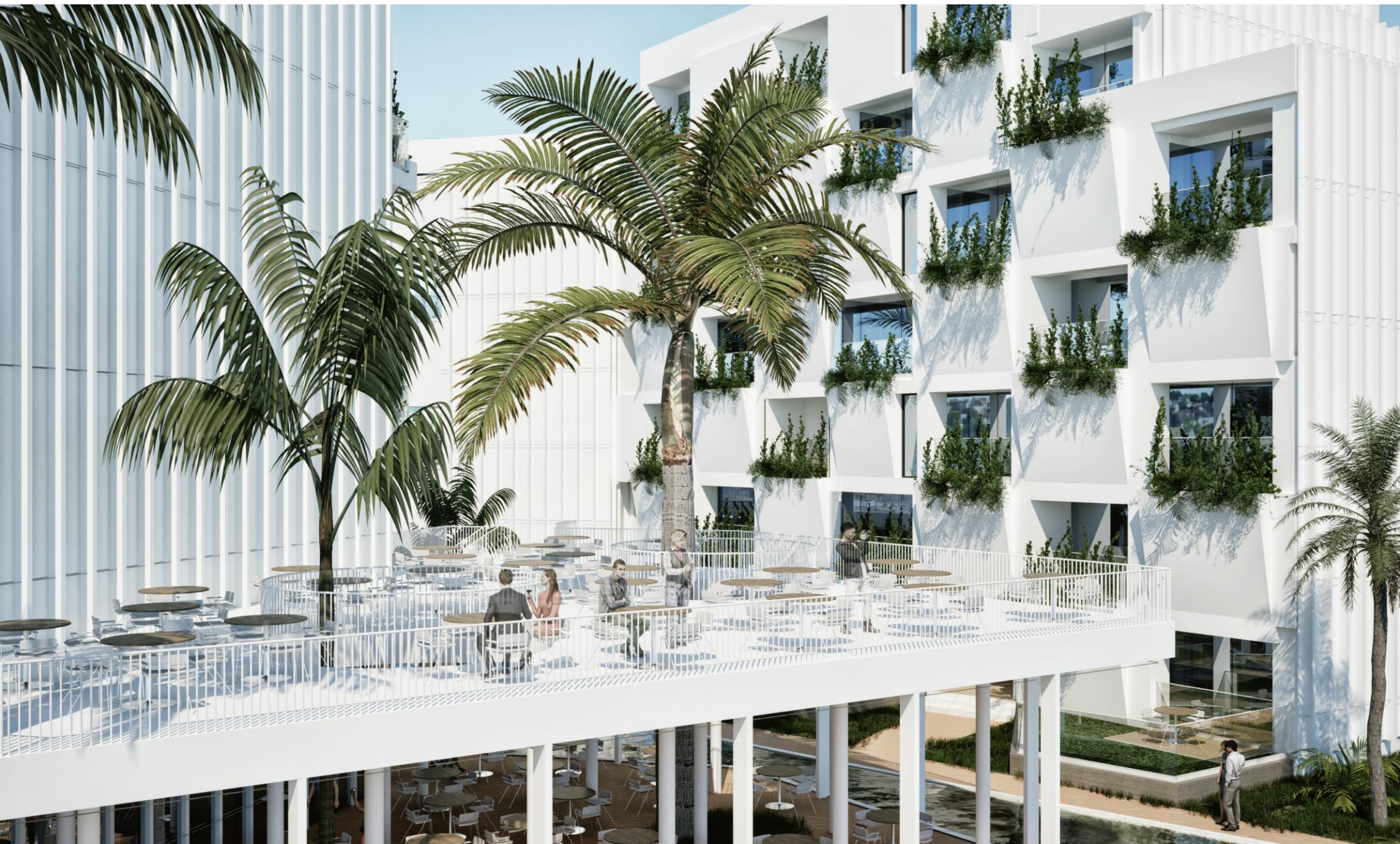
View of First Floor Hotel Terrace