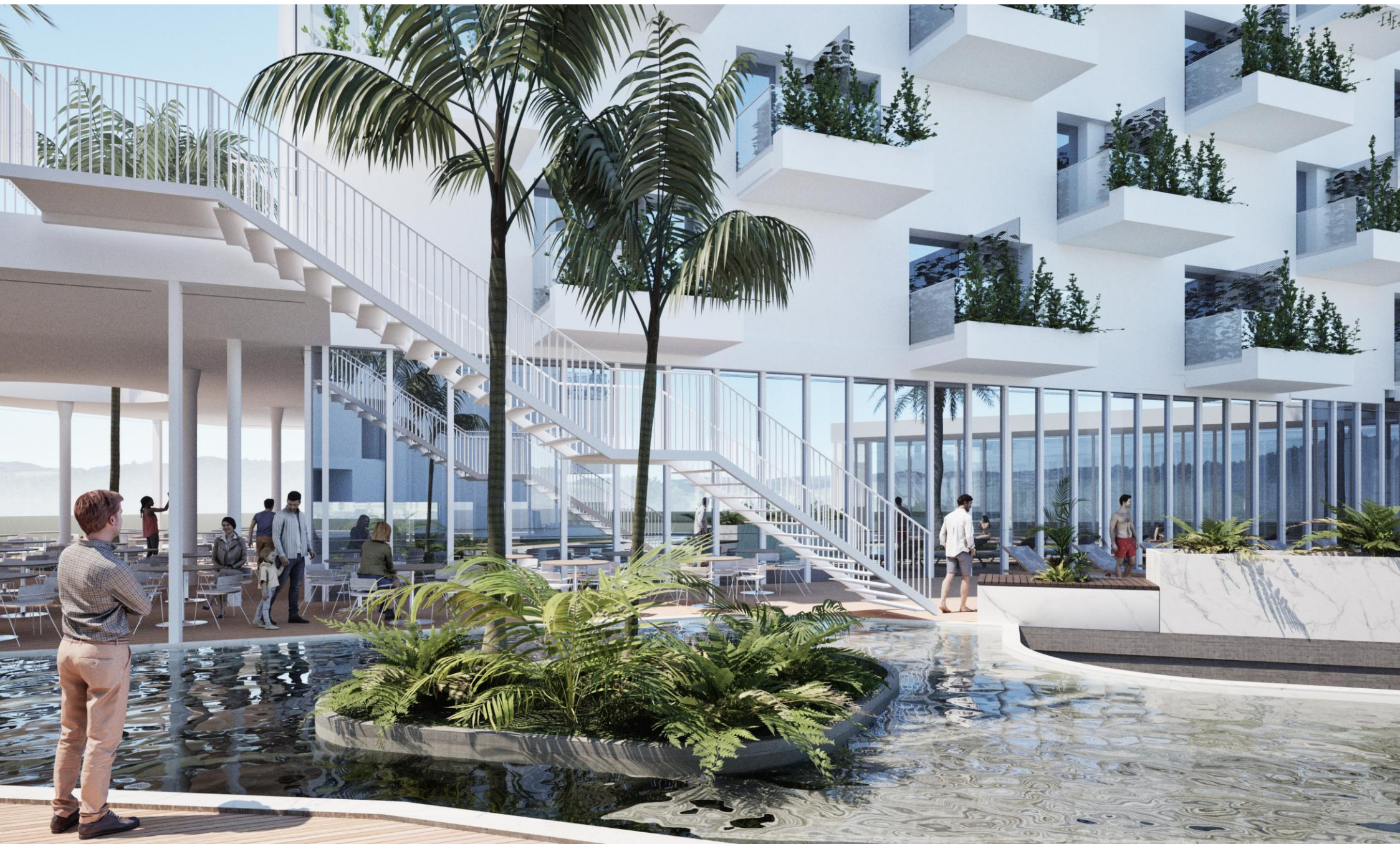
View from the Water Feature Separating the Hotel from the Apartment Building