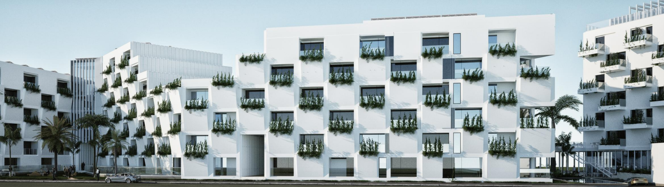
Street View from the North