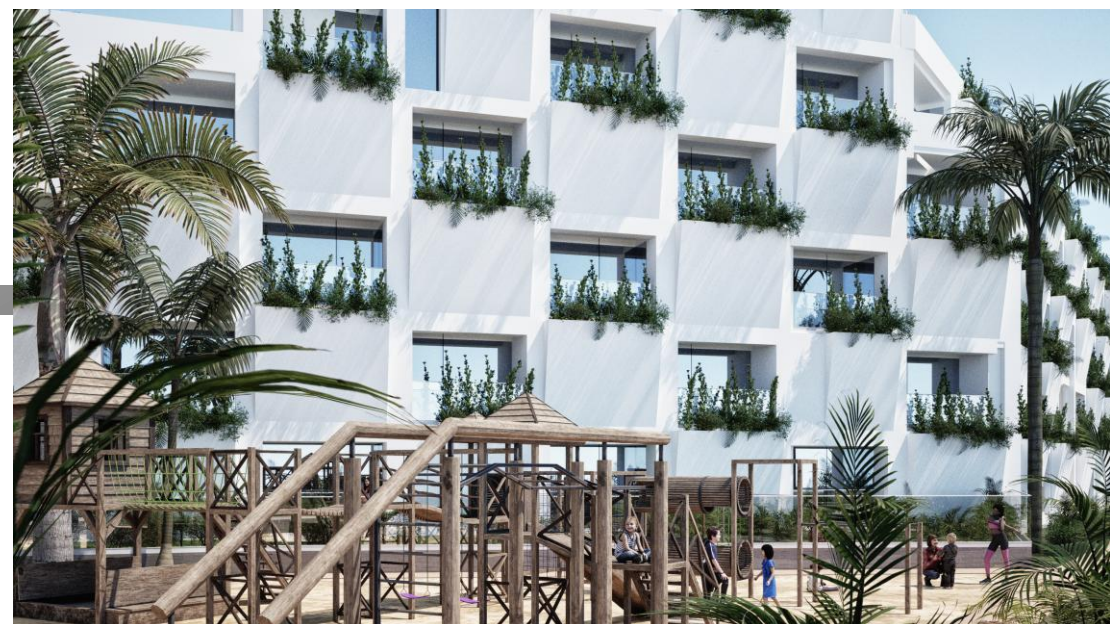
View from the Playground of the Apartment Building