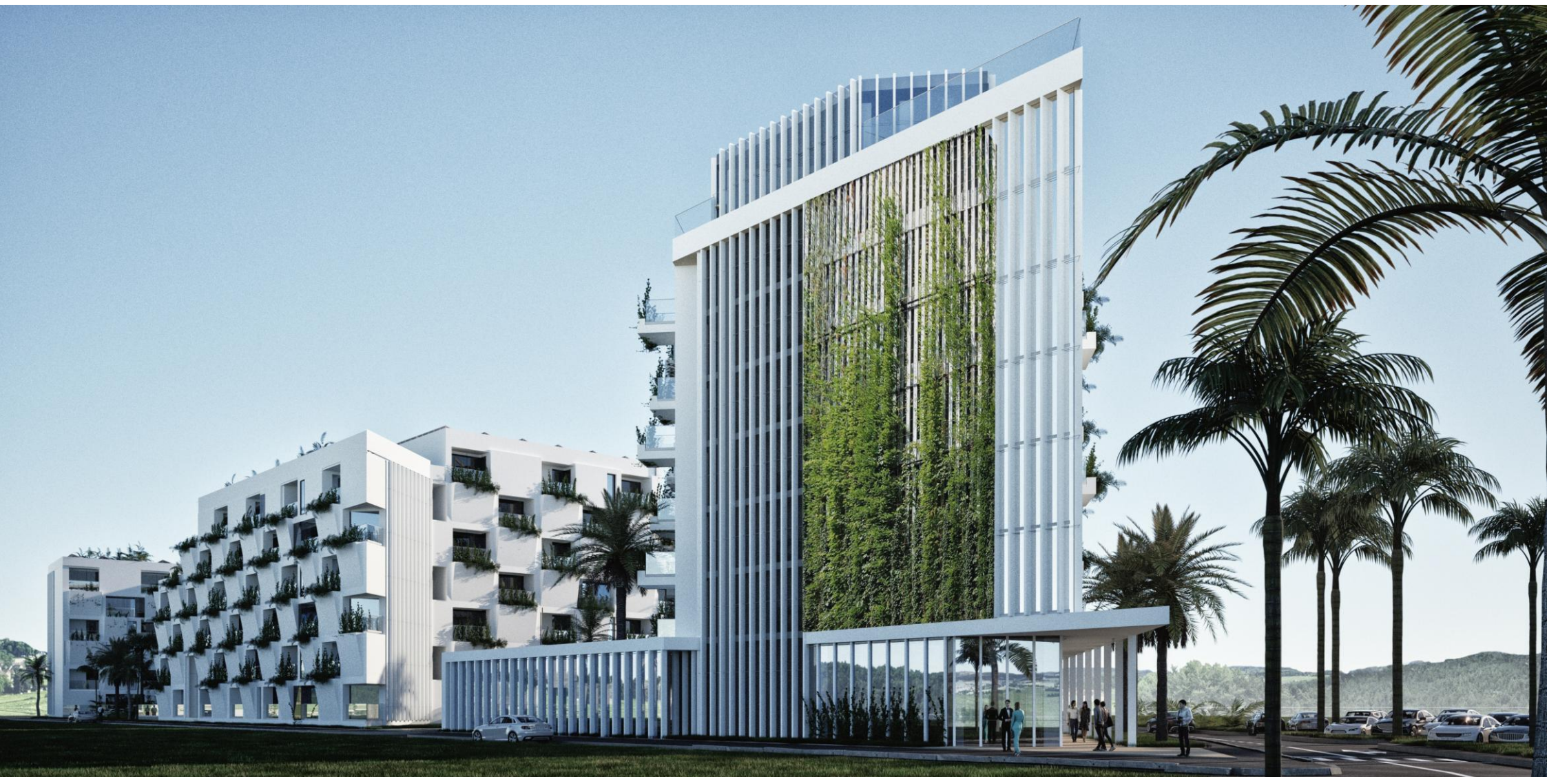
Street View from the North-West Intersection