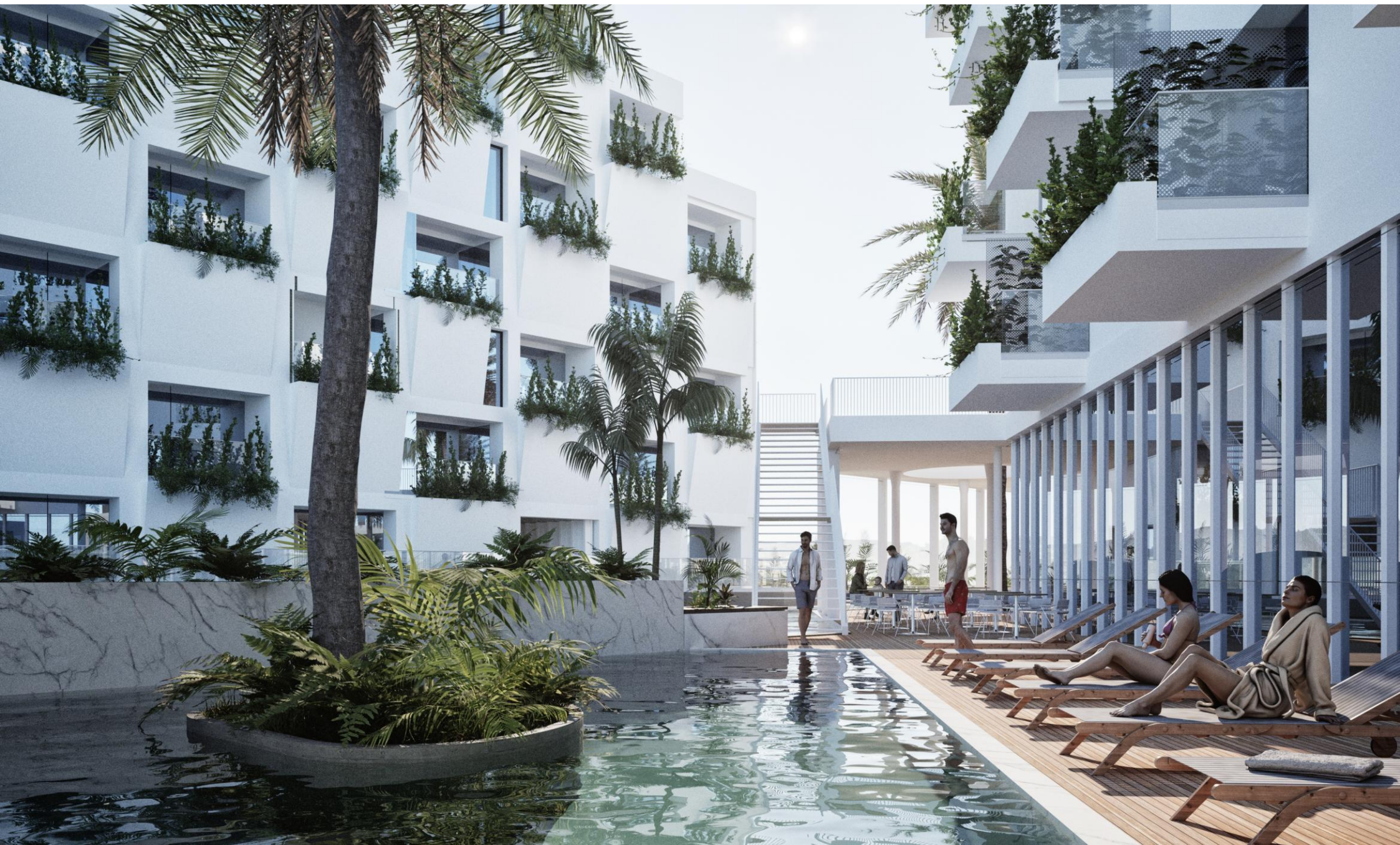
View from Hotel's Pool