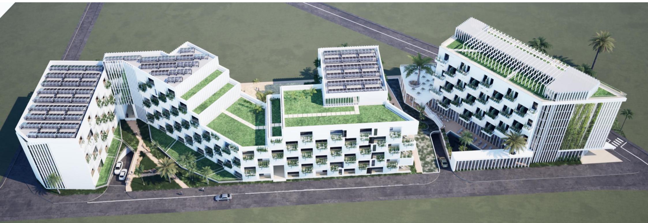
Aerial View from the North