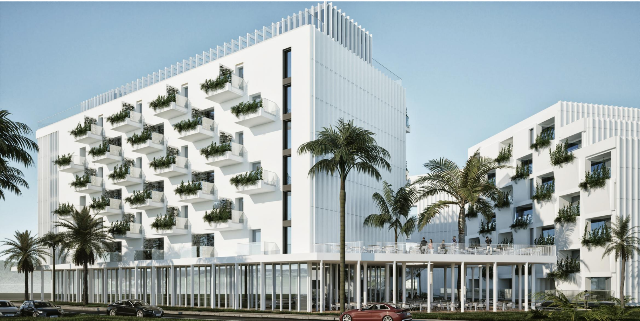
Street View from the West