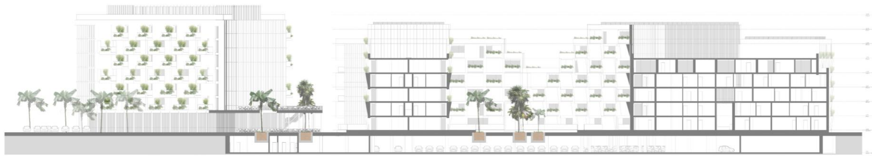
Section -apartment building