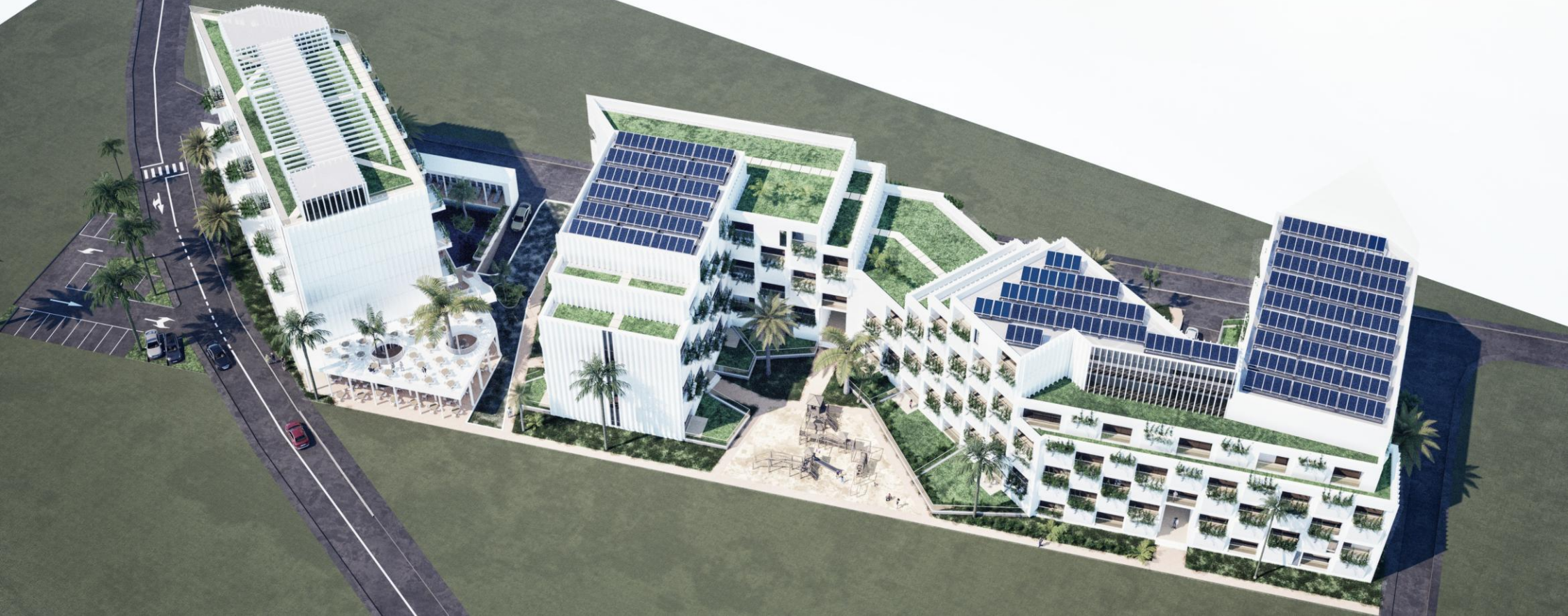
Aerial View from the South