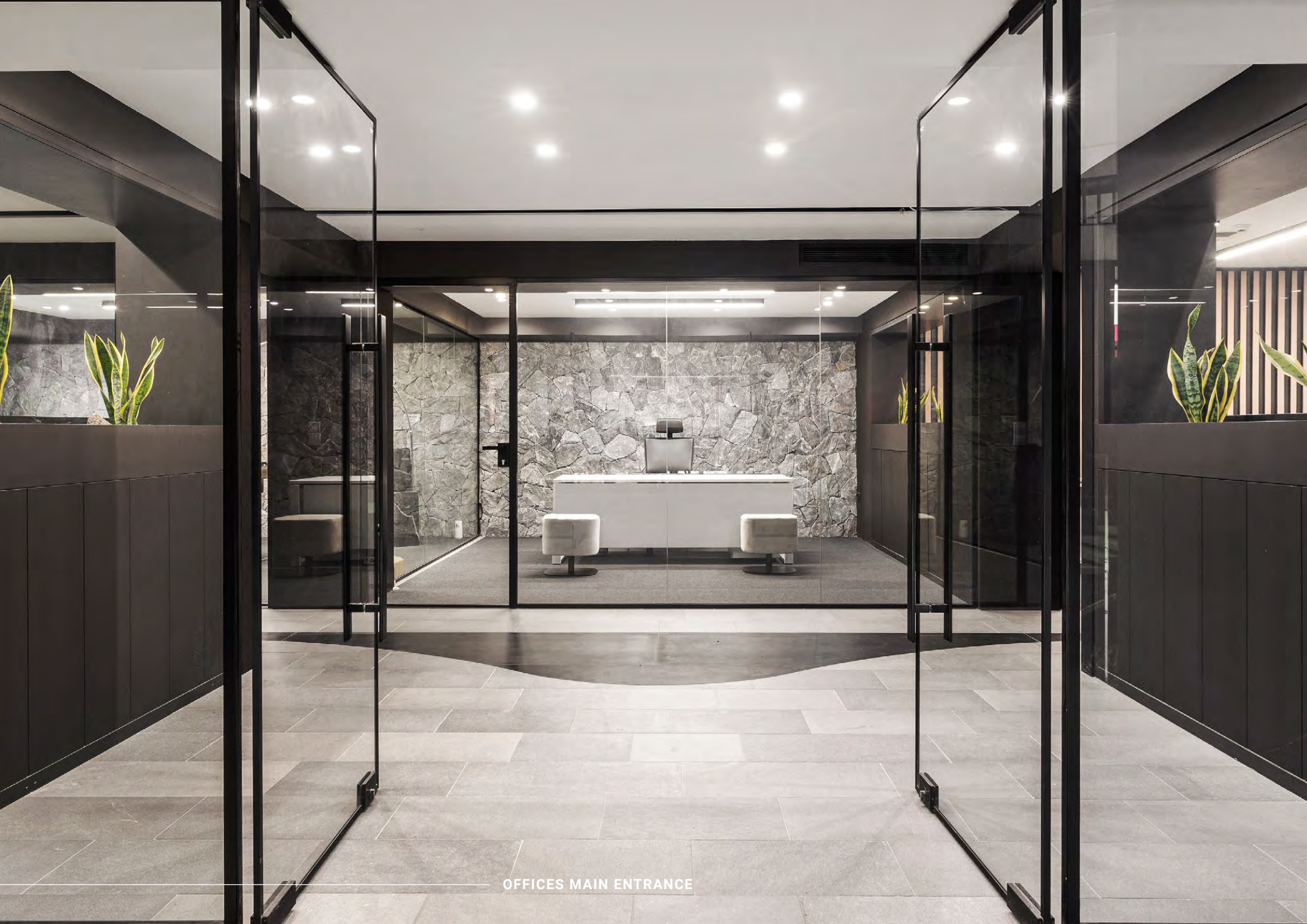
OFFICES MAIN ENTRANCE