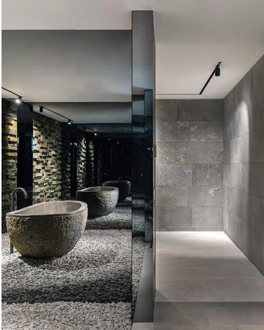
NATURAL STONE BATHTUBS