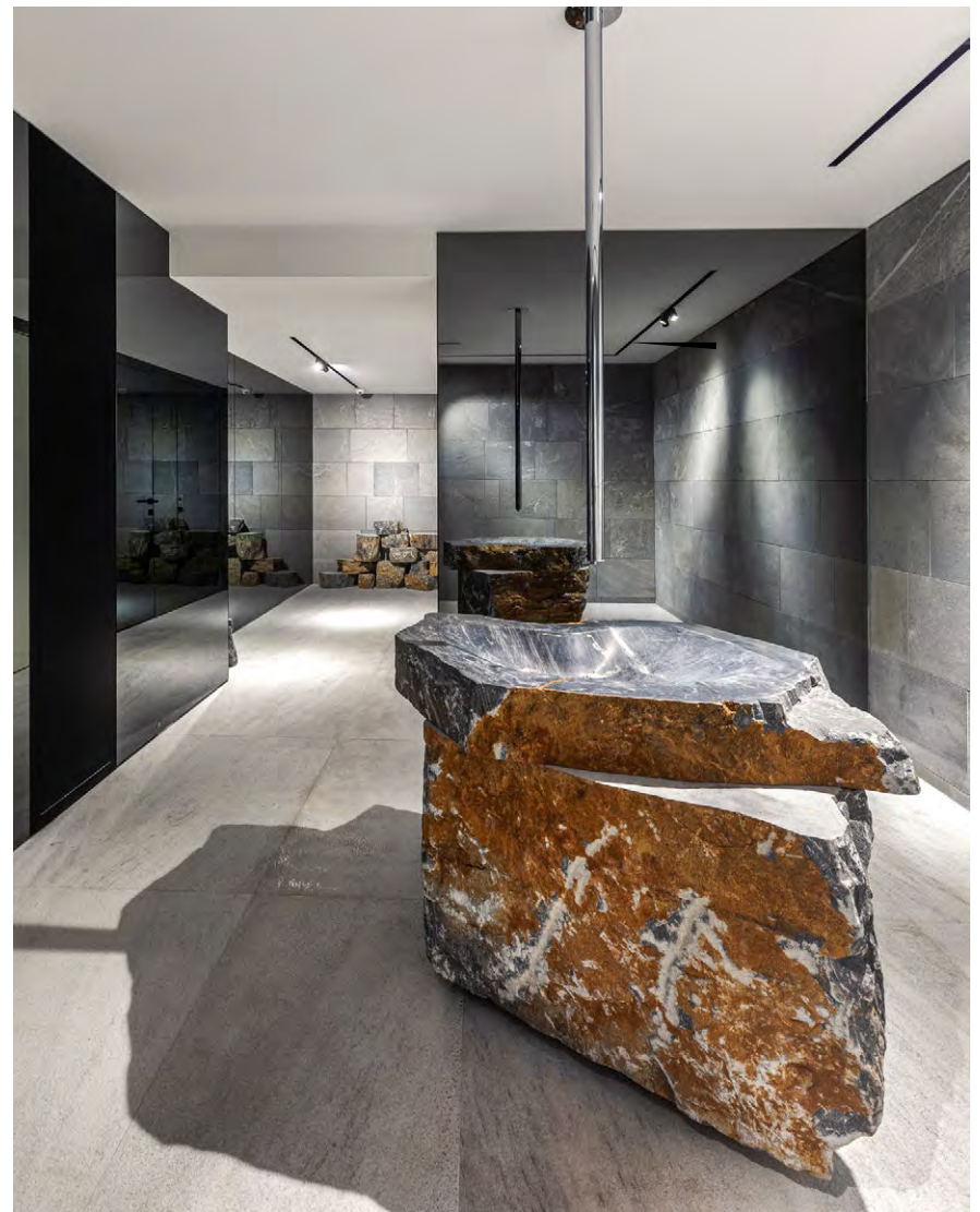
NATURAL STONE SINKS