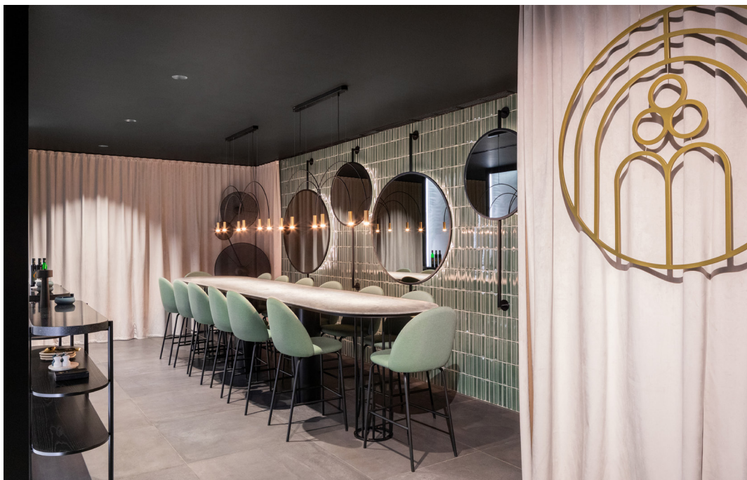
Magnet Bistro