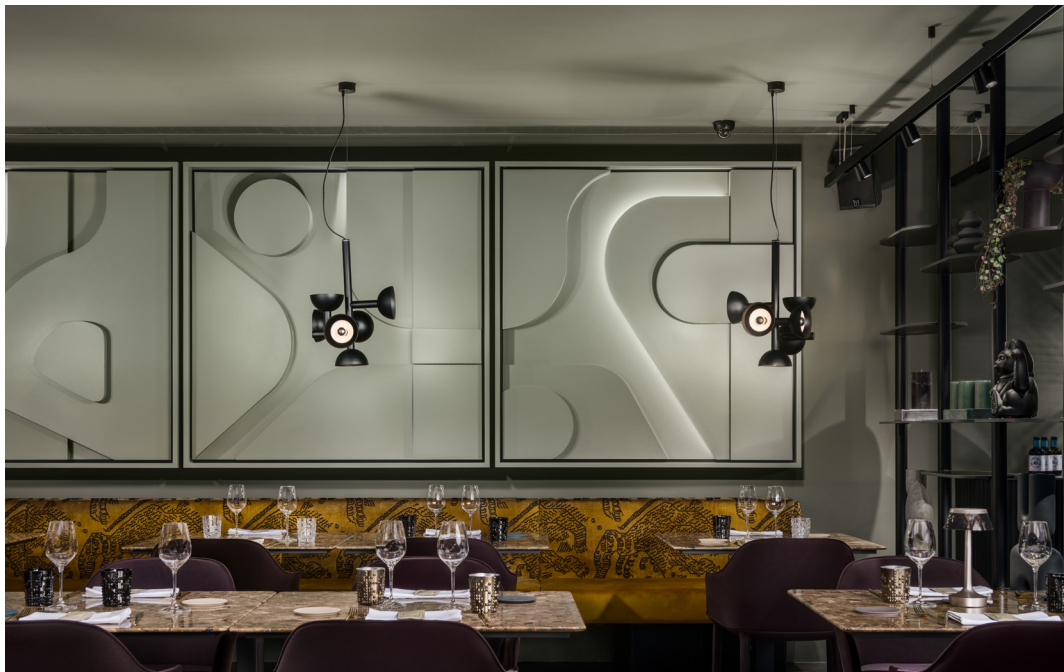
Magnet Restaurant